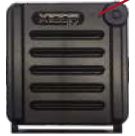
XSJB Dual Radio Interface Box