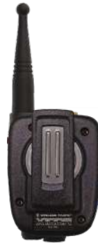
XLMC Standard long rotary shoulder mount clip