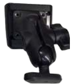
XMDM2 Mobile charger mounting arm