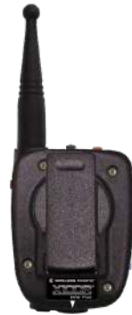
XNMC Non-metal rotary shoulder mount clip - Suit Electrical utilities