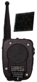
XVMC Velcro® shoulder mount option includes Velcro patch - for best shoulder placement