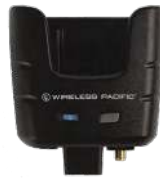
X10DR Elite Plus Gateway