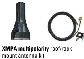
XMPA multipolarity roof/rack mount antenna kit