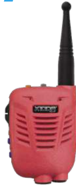
XCFC Custom Front Cover option