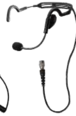
WPHFH-X10 Headset Industrial lightweight