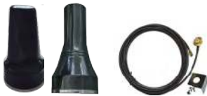
XMPA multipolarity roof/rack mount antenna kit