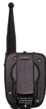
XNMC Non-metal rotary shoulder mount clip - Suit Electrical utilities