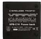
XPB-C14 In-line power bank Interface Box