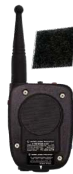
XVMC Velcro® shoulder mount option includes Velcro patch - for best shoulder placement