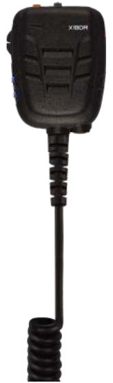
XTBM Talkback Microphone