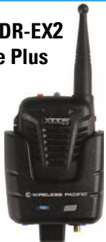
X10DR-EX2 Elite Plus