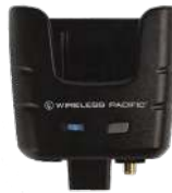
X10DR Elite Plus Gateway