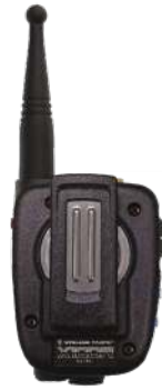
XLMC Standard long rotary shoulder mount clip