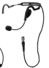
WPHFH-X10 Headset Industrial lightweight