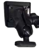
XMDM2 Mobile charger mounting arm