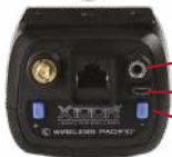
X10W Option 10 Watt speaker jack USB programming port PA/In-Car volume control