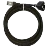
XEC-4.5 4.5 metre Extension interface cable. Order when the radio is trunk mounted. Connects to supplied XIC-1.5 interface cable.(optional)