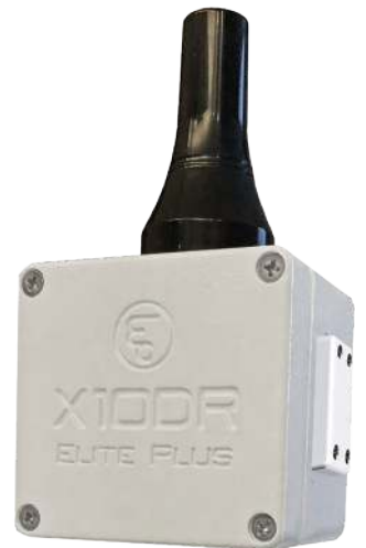
Temperature rating: -30°C to +92°C

The XRTG Plus ruggedized housing mounts on a stainless L shape bracket and is fully weatherproof against the elements. XRTG operation has been confirmed up to 92°C and down to -30°C meaning it can operate externally in most environment extremes including external use on Fire engines.