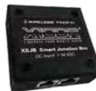
XSJB Dual Radio Interface Box