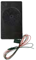
X1WK Mobile wireless charger