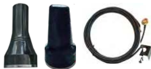
XMPA multipolarity roof/rack mount antenna kit