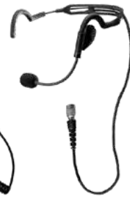
WPHFH-X10 Headset Industrial lightweight