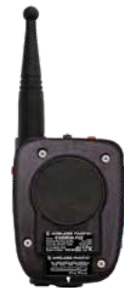
XNMC Non-metal rotary shoulder mount clip - Suit Electrical utilities