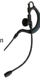
WPULH-X10 Headset Ultra-lightweight earhook style