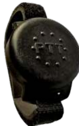
X10DR XWPB Wireless PTT Button