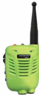
XCFC Custom Front Cover option