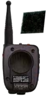
XWMC Velcro® wireless charging mount option includes Velcro patch - for best shoulder placement