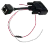
XCA-**** Radio Adaptor Refer price book (typical style)