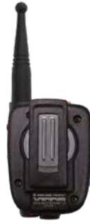
XLMC Standard long rotary shoulder mount clip