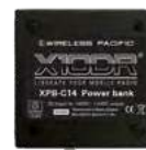
XPB-C14 In-line power bank Interface Box