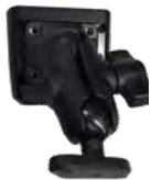
XMDM2 Mobile charger mounting arm