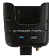
X10DR Pro Plus Gateway