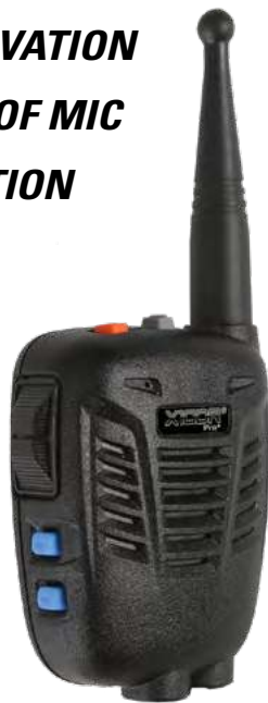
X10DR Pro Plus Handset