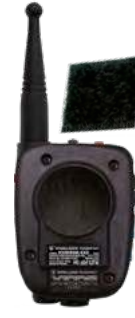
XVMC Velcro® shoulder mount option includes Velcro patch - for best shoulder placement